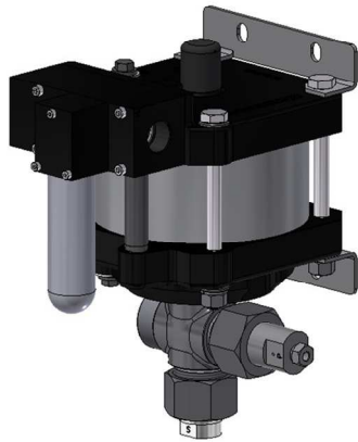
G400 (L) single acting, single air drive head, side inlet (Standard= Bottom inlet, see dimension drawing)